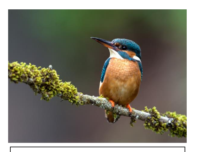
Welney Wetland Centre – 1 mile away