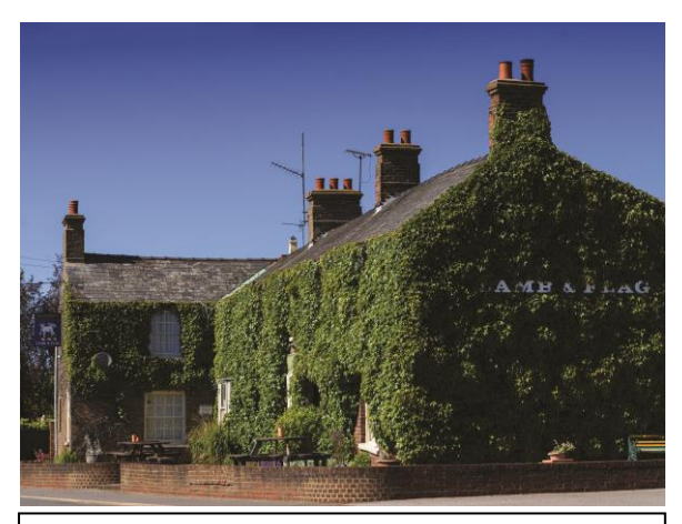
The Lamb and Flag Pub – 5-minute walk away