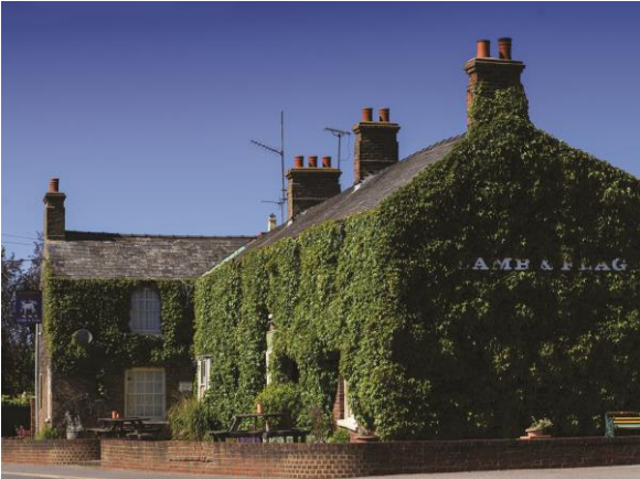
The Lamb and Flag Pub – 5-minute walk away