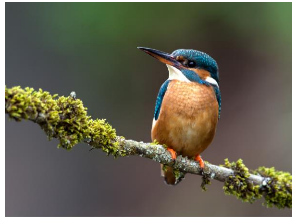
Welney Wetland Centre – 1 mile away